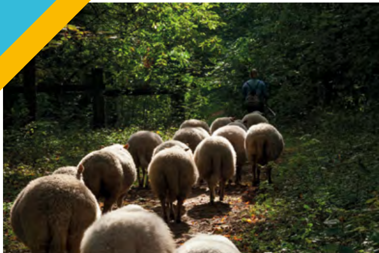
Georges Valbon park - Seine-Saint-Denis Tourisme