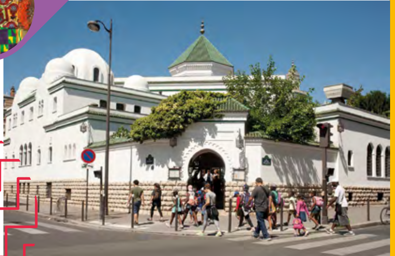
Grande mosquée de Paris