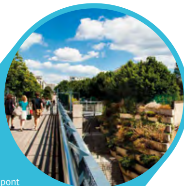
Coulée Verte

take a real summer break in Greater Paris and stroll along the Marne or the Seine river banks, stop for a drink at a guinguette [small cabarets in the suburbs and the surrounds of Paris, where craftsmen drink in the summer, on Sundays and on Festival days], take a canoe or paddle lesson and relax on the amenity beaches. The three Parisian canals are also not to be missed (the Canal Saint-Martin , the Canal de l'Ourcq and the Canal Saint-Denis ). The canals are now mostly used for recreational activities, boat excursions and food and festive cruises. Electric boats can be hired on the La Villette Basin.