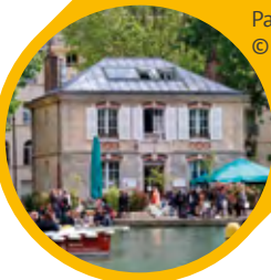
Pavillon des canaux