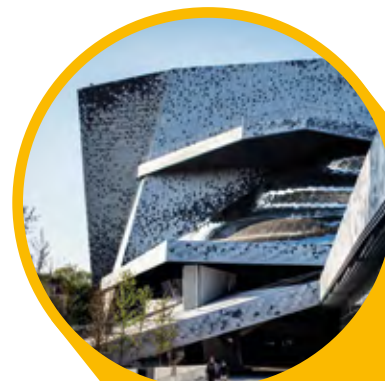
Philharmonie de Paris

multidisciplinary creative sites in which new types of modern art are tried and tested, such as Shakirail (Paris), 6B (Saint-Denis), Villa Mais d'Ici (Aubervilliers), Halle Papin (Pantin) and Les Frigos (Paris).