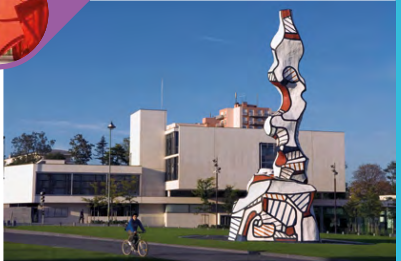
MAC VAL