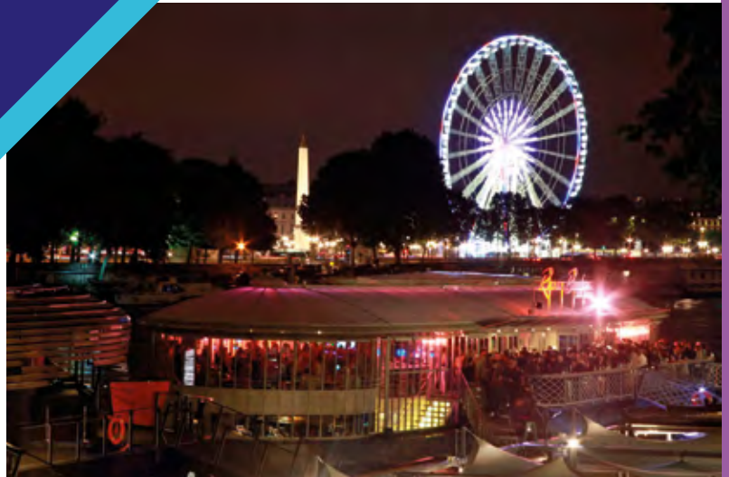
Rosa Bonheur sur Seine