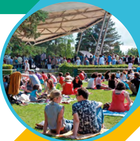
Jazz Parc Floral