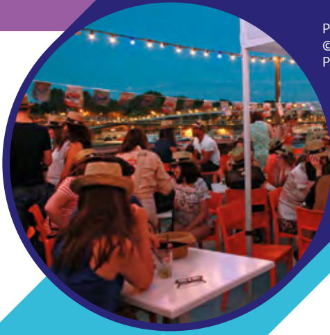
Rock en Seine