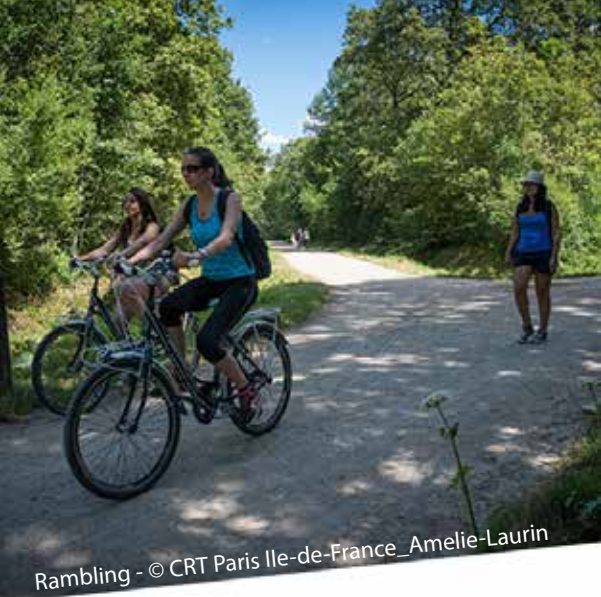
Rambling - © CRT Paris Ile-de-France_Amelie-Laurin

Without doubt, Val-de-Marne has a pronounced taste for nature and is determined to preserve it. The Bois de Vincennes and Notre-Dame or Grosbois forests, the riverbanks of the Marne and Seine, departmental parks and natural areas, all offer a variety of ways to relax and practise leisure activities.