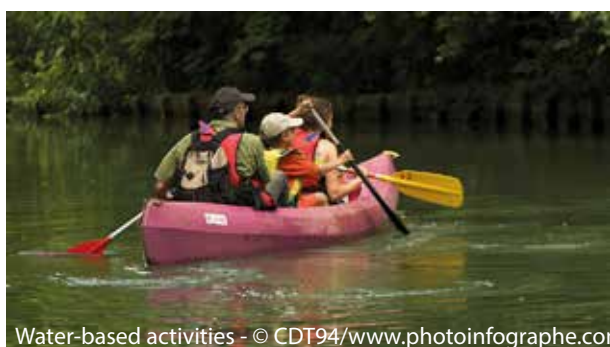
Water-based activities