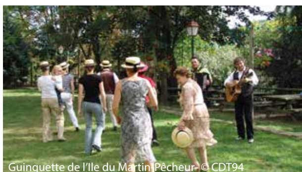
Guinguette de l'Île du Martin-Pêcheur

Three guinguettes open their doors to you.