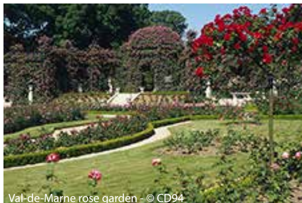
Val-de-Marne rose garden

This rose garden, a first of its kind in the world, was created by Jules Gravereaux along with the help of the landscape architect Edouard André. Explore, through the thirteen garden collections featuring 3,000 varieties, the history of the rose and follow it on its journey through the continents. You will learn all there is to know about the greatest living collection of roses, from Asia and the Far East, but also from North America, to finally the "French" rose garden.