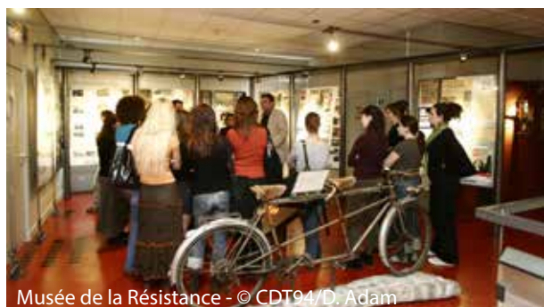
Musée de la Résistance