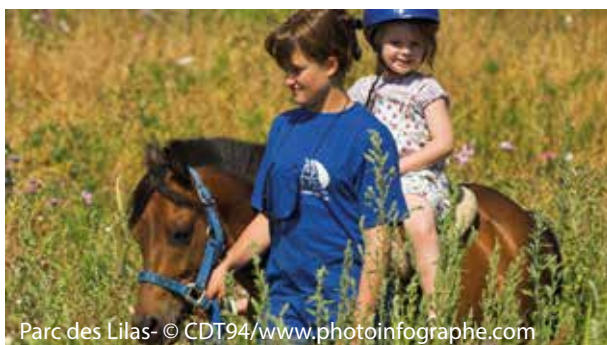
Parc des Lilas

In Poneyland at Thiais, young riders can ride Shetland ponies, one of the smallest equine animals in the world. Originally from the Shetland islands in the North of Scotland, they measure less than 107 cm from the shoulder and are ideal for starter rides for children.