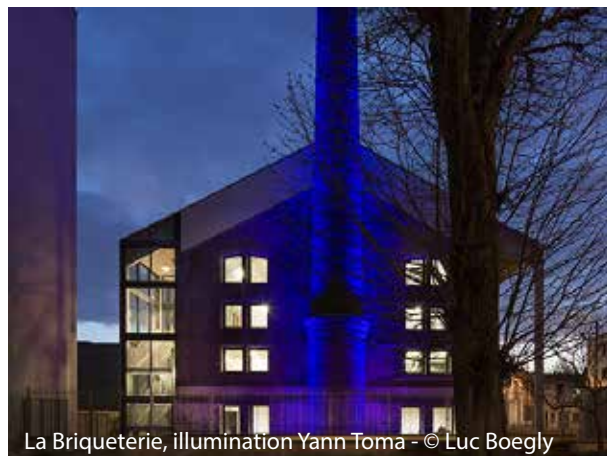
La Briqueterie, illumination Yann Toma

Bodega Feria - Champigny-sur-Marne La Lucha grande - Quai 38 - Champigny-sur-Marne Hippodrome de Vincennes