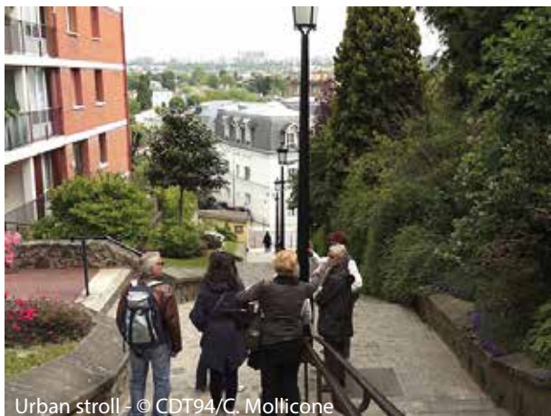
Urban stroll - © CDT94/C. Mollicone