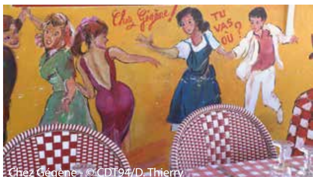
Chez Gégène

La Guinguette de l'Île du Martin-Pêcheur happens to be situated on an island on the Marne river. It is a haven of greenery and an invitation to relax and enjoy among friends.