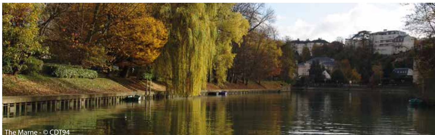
The Marne - © CDT94

Cover photo: Street art - artworks by Etnik © CRT Paris Ile-de-France - Amélie Laurin Reproduction, even partial, of articles and illustrations published is strictly prohibited.