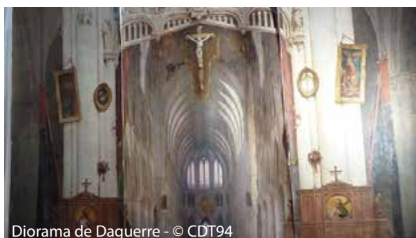
Diorama de Daguerre

Painted by Louis Daguerre, this Diorama (classified as a historical monument) is the last existing one. This painting, 5m35 by 6m15, dating from 1842, has just found its place in the heart of the church of Bry after several years of restoration.