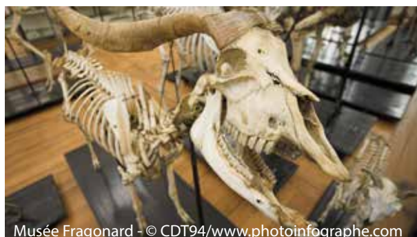
Musée Fragonard