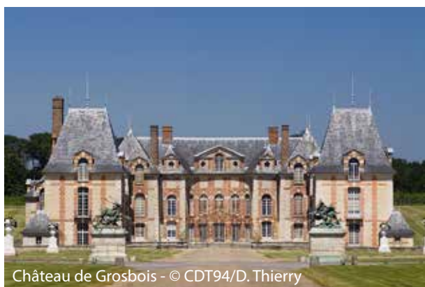
Château de Grosbois

Take the time to wander through the town of Vincennes that has been awarded the label "Town of Art and History".