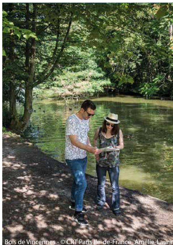
Bois de Vincennes

This forest with its 2,056 hectares is rich in exceptional fauna (deer, boar...) and flora (aquatic plants, heather, oak trees, lime trees...) that are particularly visible all along the two marked out paths. Whether you are on foot, by bike or on horseback, this green woodland is an invitation to ramble through its treks and trails.