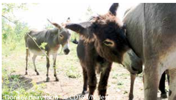
Donkey dairy farm - © CDT94/N. Jestin