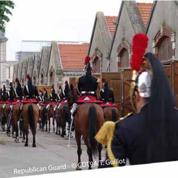
Republican Guard