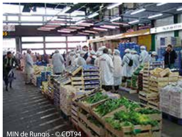
MIN de Rungis - © CDT94

After all these smells and colours it's time to enjoy the hearty brunch served up after your visit!