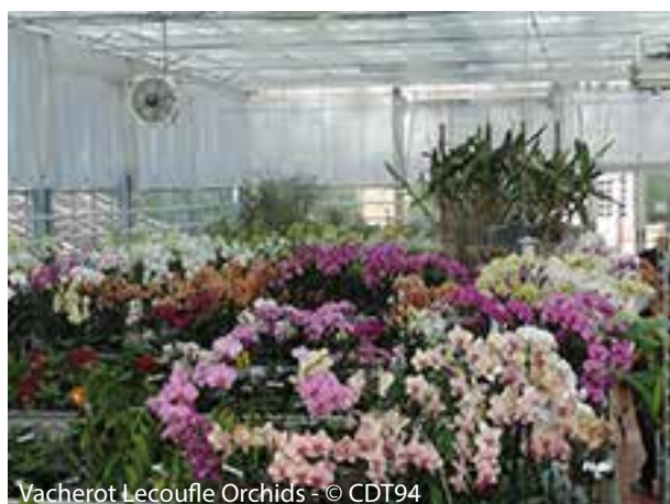
Vacherot Lecoufle Orchids