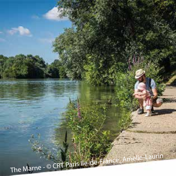
The Marne