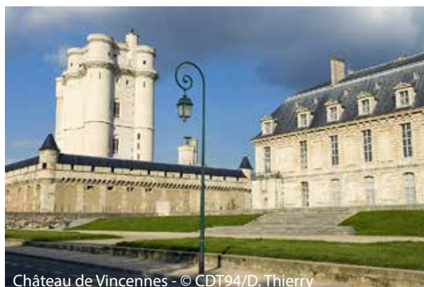
Château de Vincennes

A spectacular monument in Val-de-Marne, the Château de Vincennes is not to be missed. It was a royal residence from the 12th to the 18th century. It has preserved its ramparts, its medieval towers, its gothic chapel "Sainte-Chapelle" and its stained-glass windows and more importantly, its medieval dungeon, the highest in Europe (50 metres). A free or guided tour of this fortress managed by the "Centre des monuments nationaux" (National Monuments Centre) will take you back through history, to Charles V apartments and the prison life of some famous prisoners such as Henri de Navarre, the Marquis de Sade or Mirabeau.