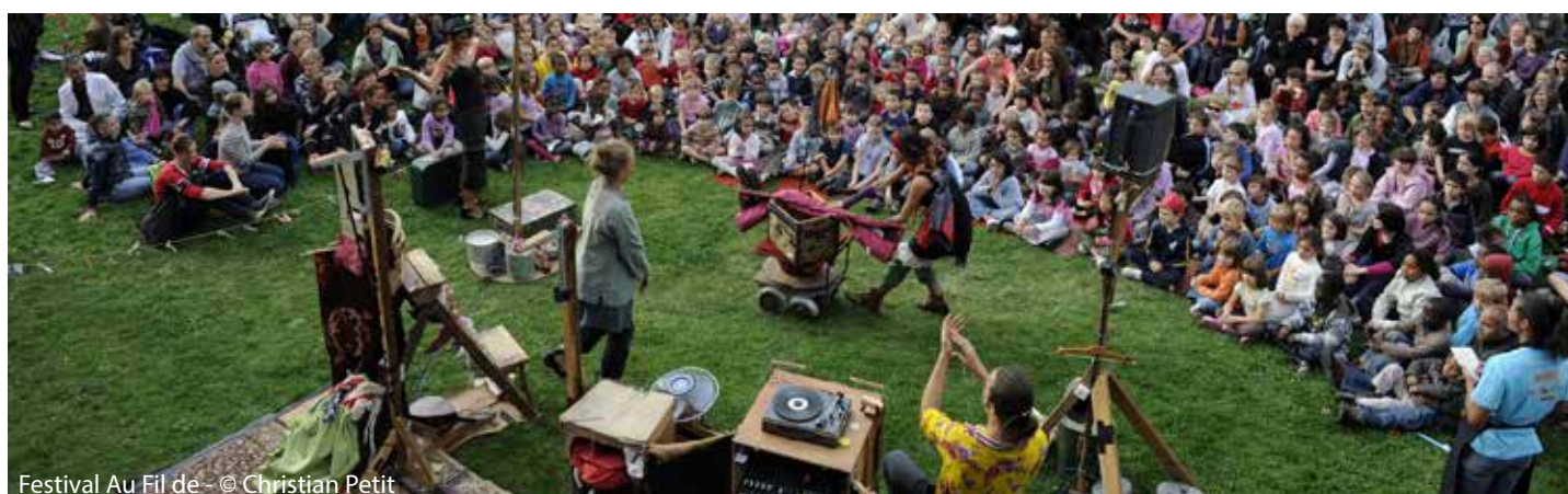
Festival Au Fil de

So today, Val-de-Marne offers a genuine tourist and cultural mosaic, a reflexion of its own identity.