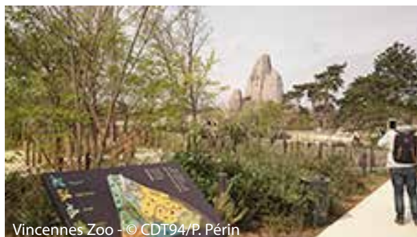
Vincennes Zoo

Right in the middle of the woods, you might spot a giraffe and then a wolf. No, you are not dreaming! These animals belong to the Paris-Vincennes zoo. The zoo is organised into five major natural environments (called biozones) taking you on a round trip from the Sudanese Sahel to the European evergreen forests, passing through the Amazon forest recreated inside an immense tropical greenhouse. Roam around and discover a variety of 180 species!