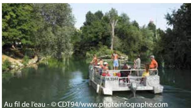
Au fil de l'eau

Hop on board a boat and let yourself glide along to admire the landscape around the Marne. There are several cruise companies to choose from. Nayptune Marne cruises takes you on a guided tour to discover the many islands, three of which are classified as "Réserve naturelle départementale des Iles de la Marne" - a natural reserve. Perhaps you prefer to sail in a catalante to admire the fauna and flora with the association 'Au fil de l'eau'. In summer, take yourself back to the days of the ferryman and cross over the Marne at Champigny-sur-Marne and Nogent-sur-Marne or the Seine at Choisy-le-Roi. It is free of charge.