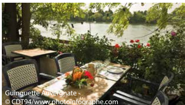
Guinguette Auvergnate

Chez Gégène is an establishment which has honoured the greatest names in cinema and welcomes you to a 50's-60's style decor on the banks of the Marne.