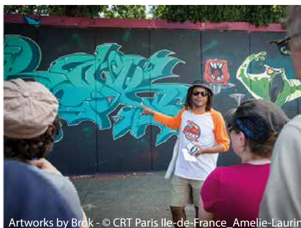
Artworks by Brok

You can also take part in a guided tour ( www.tourisme-valdemarne.com ) or follow one of our proposed tours on the web site.