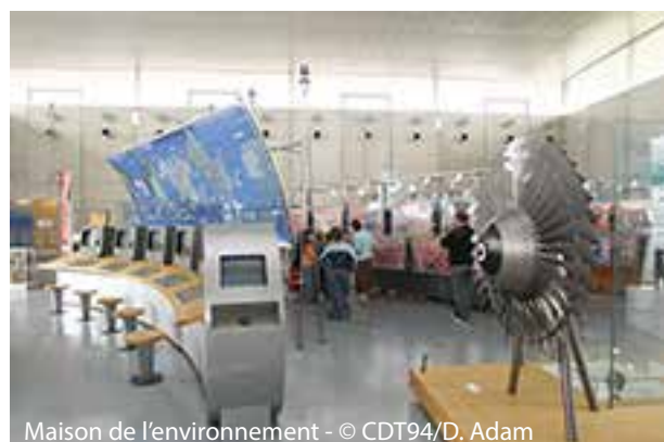
Maison de l'environnement