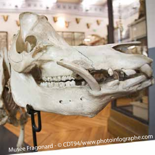
Musée Fragonard