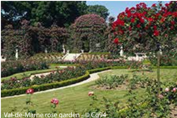
Val-de-Marne rose garden

Without doubt, Val-de-Marne has a pronounced taste for nature and is determined to preserve it. The Bois de Vincennes and Notre-Dame or Grosbois forests, the riverbanks of the Marne and Seine, departmental parks and natural areas, all offer a variety of ways to relax and practise leisure activities. It is a novel way to discover Val-de-Marne at your own pace and from another viewpoint.