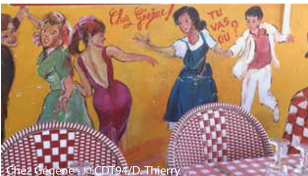
Chez Gégène

La Guinguette de l'Île du Martin-Pêcheur happens to be situated on an island on the Marne river. It is a haven of greenery and an invitation to relax and enjoy among friends.