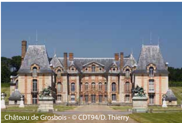
Château de Grosbois

Take the time to wander through the town of Vincennes that has been awarded the label "Town of Art and History".