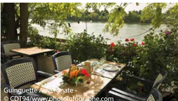
Guinguette Auvergnate

Chez Gégène is an establishment which has honoured the greatest names in cinema and welcomes you to a 50's-60's style decor on the banks of the Marne.