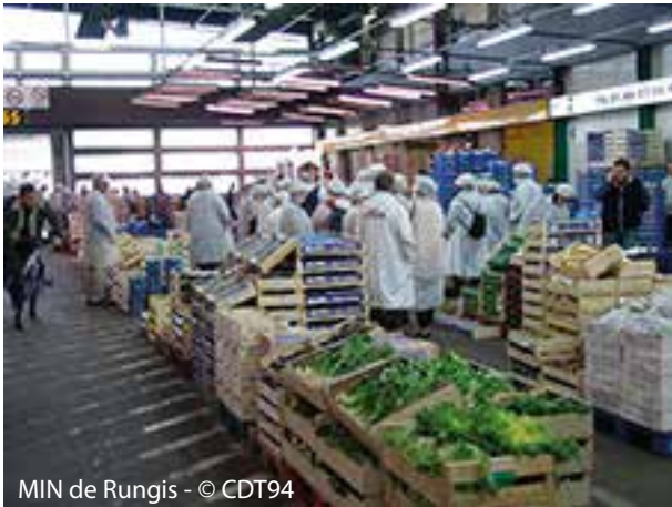
MIN de Rungis

Companies in Val-de-Marne open their doors and invite you in to discover their savoir-faire. Follow the enthusiastic technician or member of staff in their daily routine to better understand the job at hand, the techniques used and the inner workings of the firm. Dare to go behind the scenes of the world's largest wholesale market for fresh produce.