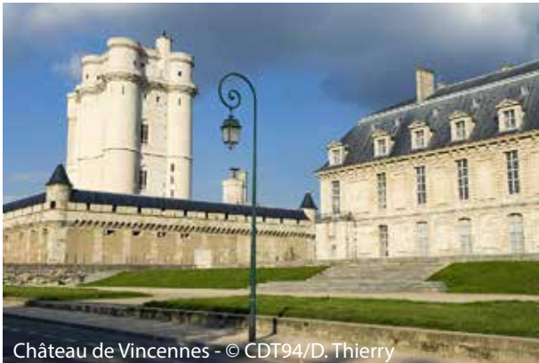
Château de Vincennes

Val-de-Marne is rewarded with a rich and varied cultural heritage. Delve into the history and cross through the ages to explore majestic buildings such as the "Château de Vincennes" and the "Château de Grosbois" and museums on the 19th century or even on National resistance.