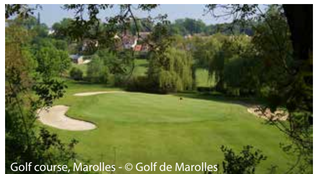
Golf course, Marolles

Two golf courses are ready to welcome you no matter what your level. Improve your swing in an exceptional natural setting: the undulating and wooded golf course Marolles-en-Brie (an 18-hole golf course) and catch a glimpse of the Réveillon riverbed. You can also discover this sport at the Tremblay departmental park with its 9-hole golf course in Champigny-sur-Marne.