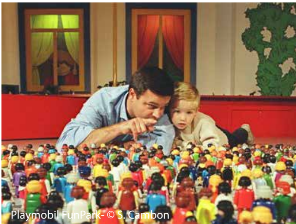
Playmobil FunPark

This museum is an invitation to discover science, digital innovation and lasting development through 60 interactive displays, from the classical optical illusions to very original experiments. The museum also contains an annual temporary exhibition, visits and workshops around science for the 5-14 age group and multimedia for all ages.