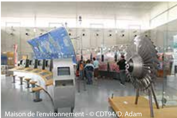
Maison de l'environnement - © CDT94/D. Adam

After all these smells and colours it's time to enjoy the hearty brunch served up after your visit!