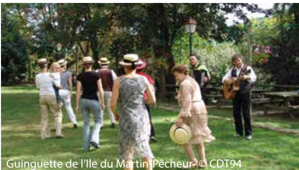
Guinguette de l'Île du Martin-Pêcheur - © CDT94

Three guinguettes open their doors to you.