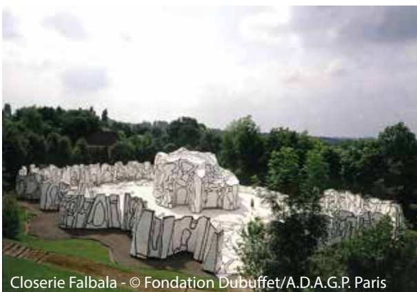
Closerie Falbala - © Fondation Dubuffet/A.D.A.G.P. Paris

Not far from here, take the time to discover CREDAC in Ivry-sur-Seine. Located in the former grommet factory, this contemporary art centre is an exhibition space and place to experiment favouring exchanges between artists and the general public.