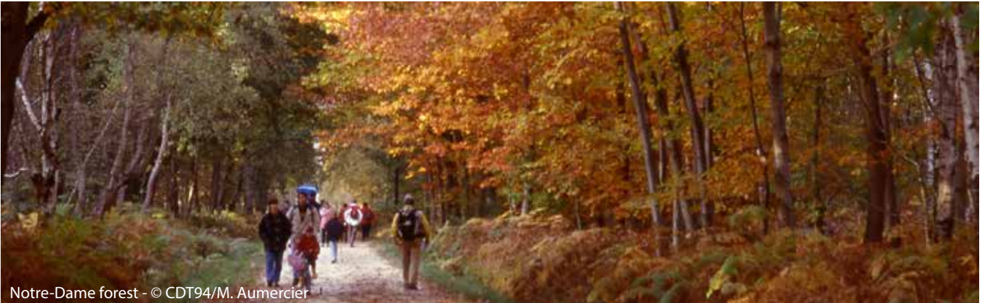
Notre-Dame forest