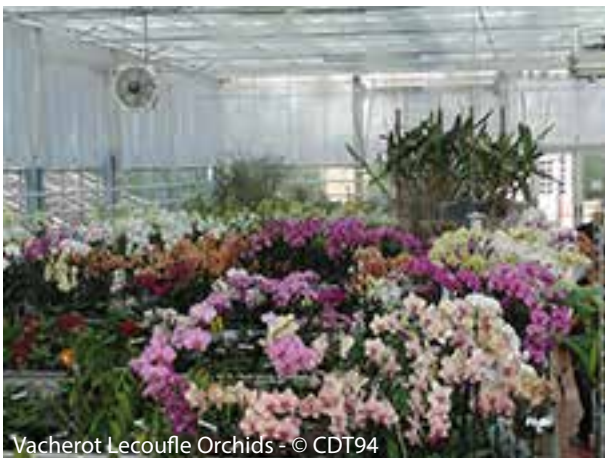
Vacherot Lecoufle Orchids

This rose garden, a first of its kind in the world, was created by Jules Gravereaux along with the help of the landscape architect Edouard André. Explore, through the thirteen garden collections featuring 3,000 varieties, the history of the rose and follow it on its journey through the continents. You will learn all there is to know about the greatest living collection of roses, from Asia and the Far East, but also from North America, to finally the "French" rose garden.