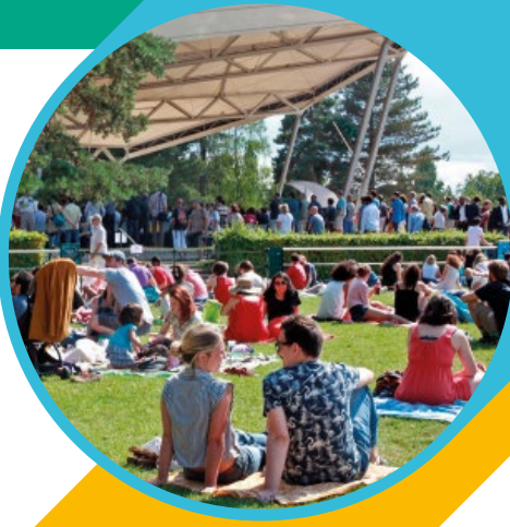
Jazz Parc Floral