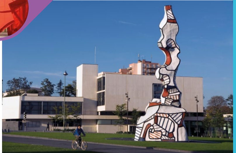
MAC VAL