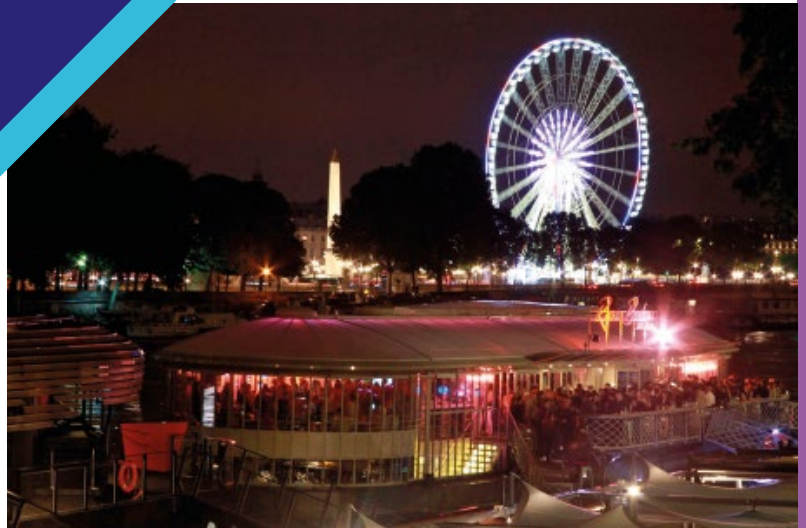
Rosa Bonheur sur Seine