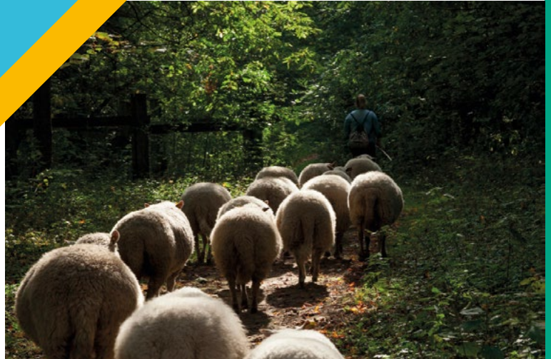
Georges Valbon park - Seine-Saint-Denis Tourisme