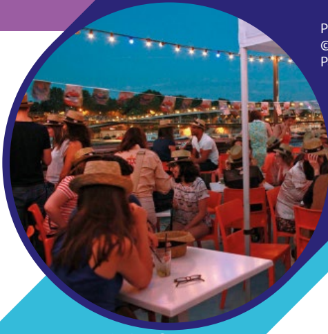
Rock en Seine