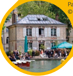
Pavillon des canaux