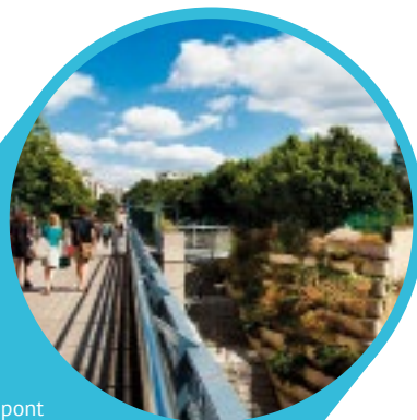
Coulée Verte

take a real summer break in Greater Paris and stroll along the Marne or the Seine river banks, stop for a drink at a guinguette [small cabarets in the suburbs and the surrounds of Paris, where craftsmen drink in the summer, on Sundays and on Festival days], take a canoe or paddle lesson and relax on the amenity beaches. The three Parisian canals are also not to be missed (the Canal Saint-Martin , the Canal de l'Ourcq and the Canal Saint-Denis ). The canals are now mostly used for recreational activities, boat excursions and food and festive cruises. Electric boats can be hired on the La Villette Basin.