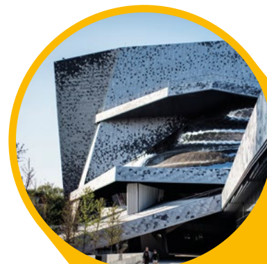
Philharmonie de Paris

multidisciplinary creative sites in which new types of contemporary art are tried and tested, such as Shakirail (Paris), 6B (Saint-Denis), Villa Mais d'Ici (Aubervilliers), Halle Papin (Pantin) and Les Frigos (Paris).