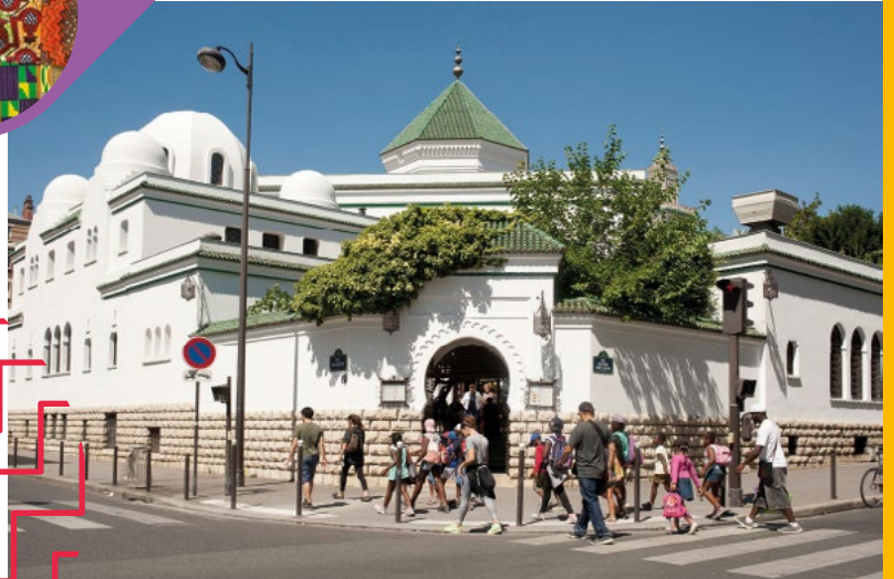
Grande mosquée de Paris